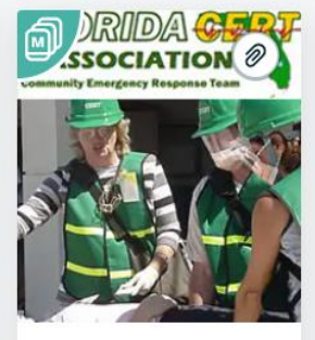
2018 Disaster Drill Participant